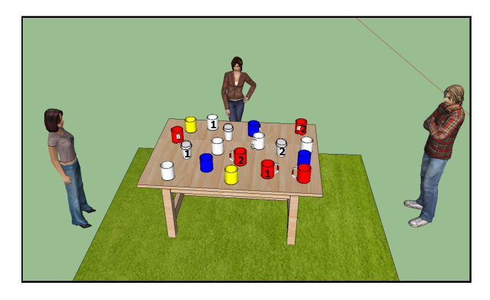
Figure 1: A virtual scene with two dialogue partners and an observer Katie. Objects labelled with a participant ID were removed in that person's view of the scene.

in a description, over several turns of dialogue. We are investigating this in another related line of work.