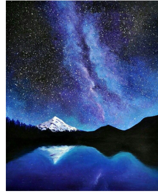
Figure 1: Illustration I

Unaddressed participants also display interesting gaze be-