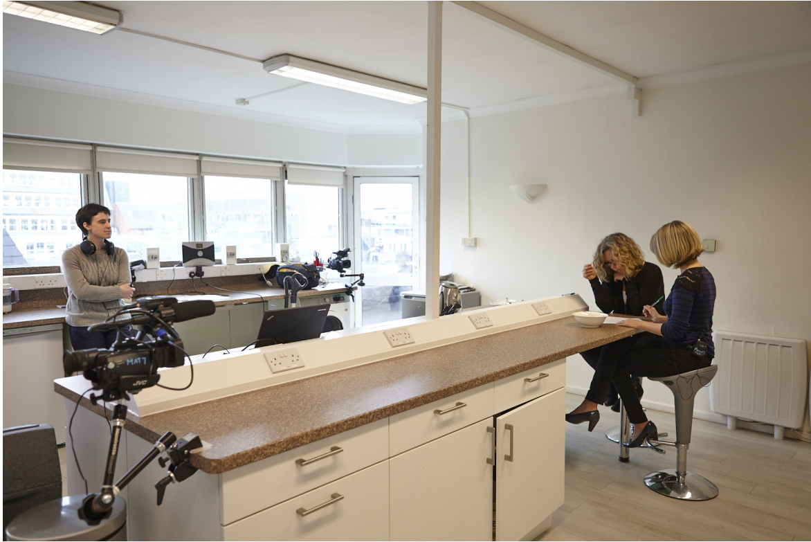
Figure 3: Session in progress (Original Scene)

(Spontal corpus), and the IFA dialogue video corpus (IFADV) in Dutch are examples of multiple-angle recorded data, but they focus either on social function or only on the referential functions (Brône and Oben, 2014). In the current study, we combine these two functions where reference is part of the interaction. This is more common in a natural multi-modal dyadic dialogue and uses two cameras to gain access to multiple angle interactions that allow analyses of fine-grained, reliable behavioural features.