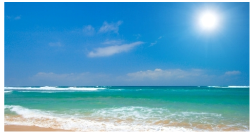
Figure 2: Illustration II

haviour showing that they anticipate turn shifts between primary participants by looking towards the projected next speaker before the completion of the ongoing turn (Holler and Kendrick, 2015). This may be because gaze has a 'floor apportionment' function, where gaze aversion can be observed in a speaker briefly after taking their turn before returning gaze to their primary recipient closer to turn completion (Kendon, 1967; Brône et al., 2017).